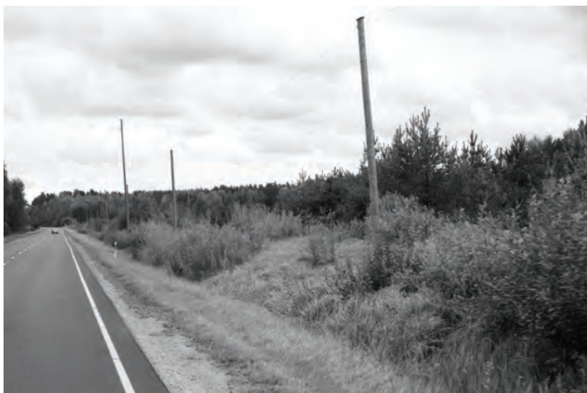
Figure 7. Hay rolls. Road E-22 Riga – Tukums.