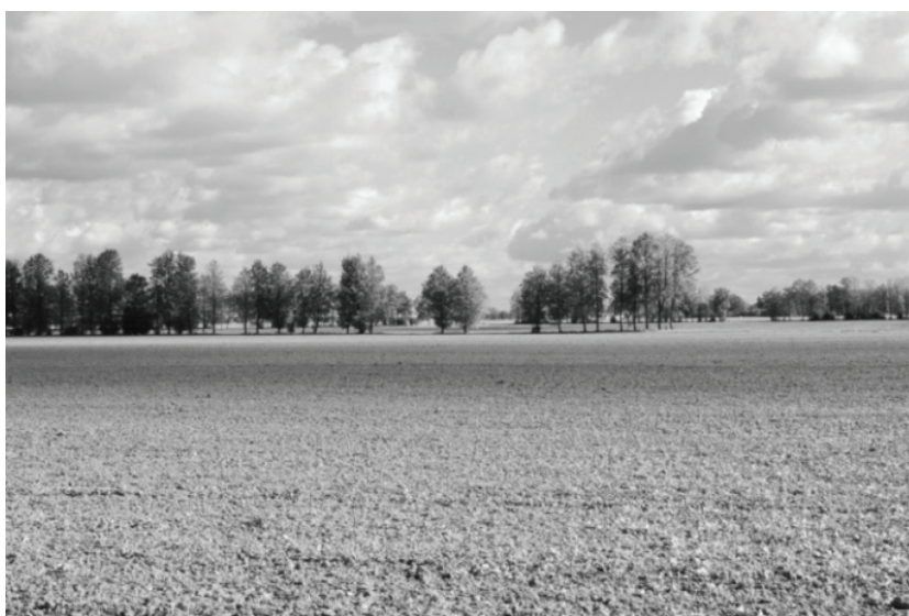
Figure 4. Continuous protection plantings along the road E-77 Meitene – Jelgava.