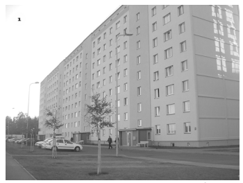
Figure 2.1. New area of dwelling houses.