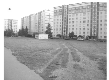
Figure 2.6. Soviet time block houses.