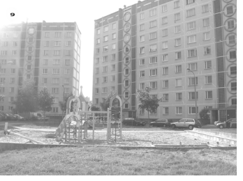
Figure 2.9. Soviet time block houses with new playground.