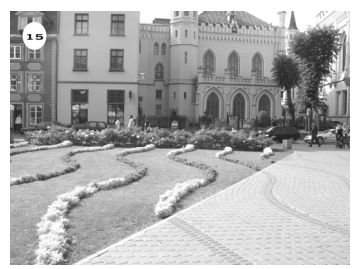
Figure 2.15. Area related to the history with new fashion landscape features solution.