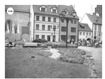
Figure 2.16. Old town with flower beds.