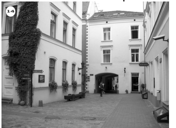
Figure 2.14. Area related to the history old town.