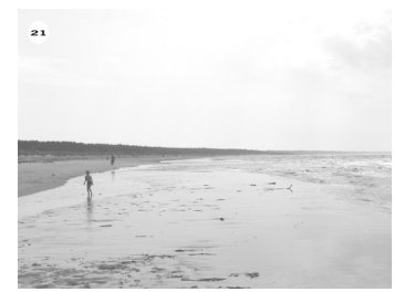
Figure 2.21. Water landscape. Costal area.