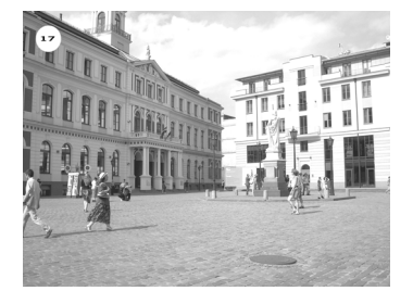
Figure 2.17. Area related to the history with new architectural features.