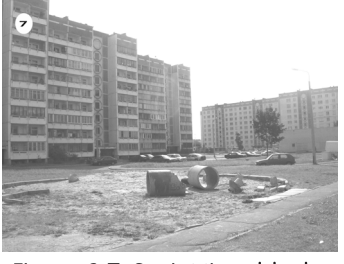
Figure 2.7. Soviet time block houses.