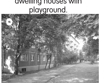
Figure 2.5. Soviet time fivestoried block houses.