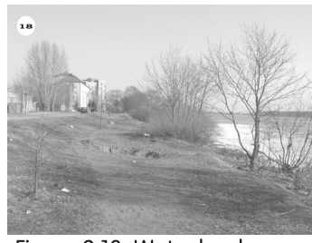
Figure 2.18. Water landscape. Costal territories.