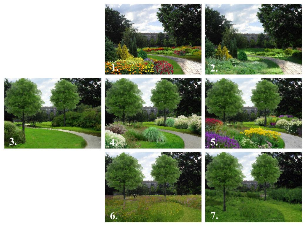
Fig. 2. Seven alternatives of different plantings in Jelgava. Created by M. Veinberga.

past planning of public green structure, which maintains traditional, verified design estranged from nature and characterized with wide areas of artificial and ornamental materials, geometric forms and planting which is not typical for the Latvian climate.