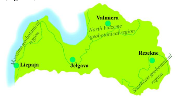
Fig. 1. Location of the selected four cities on a map of Latvia. Created by M. Veinberga.

Four Latvian cities (Liepaja, Jelgava, Rezekne and Valmiera) were selected for research of aesthetic and ecological qualities of plantings, taking into account the following criteria: 1) each city represents different historic region of Latvia (Kurzeme, Zemgale, Latgale and Vidzeme) and Latvian planning region; 2) each city represents one of geobotanical regions; 3) the cities are related and comparable by area, population and green structure (Figure 1).